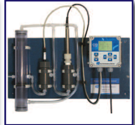
Model FCA-22 Free Chlorine Analyzer